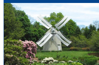
One of Cape Cod's many Windmills