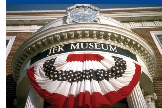
Visit to the JFK Museum