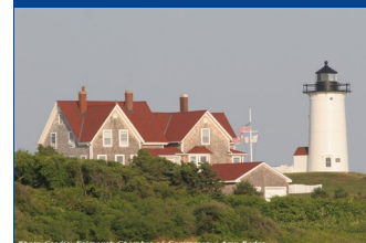
Lighthouse overlooking Vineyard Sound